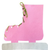
Ice Skate Craft Mar 3 to Mar 15