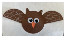
Owl Mar 16 to Mar 28

Pick up supplies in the Children's Room to make Grab & Go crafts at home, while supplies last.